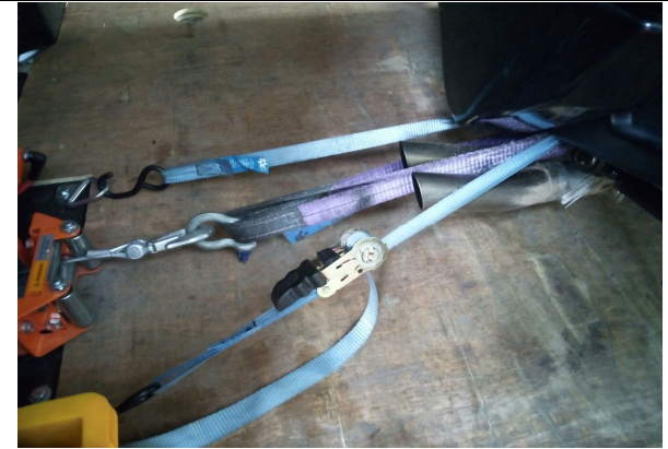
BACK - strap around the frame at the rear (where it is a V shape) and over the top of the pivot bar (do NOT strap around the track rods)