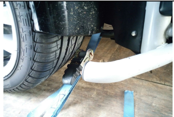
SIDES - strap around the anti-roll bar, to exit forward of the rear wheel and under the bullbar